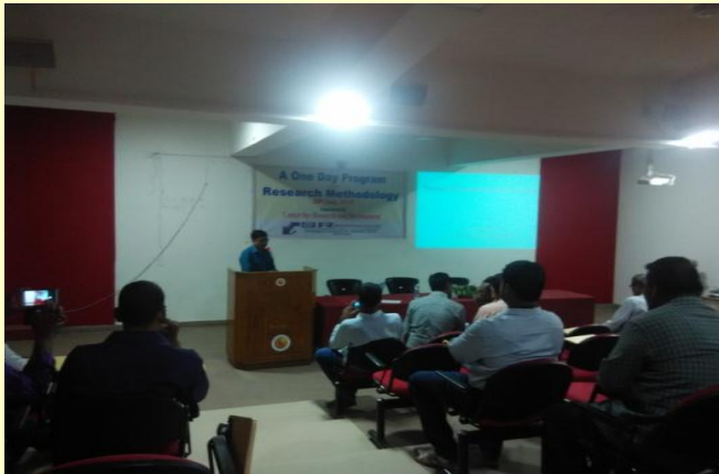
Fig: Seminar on Research Methodology