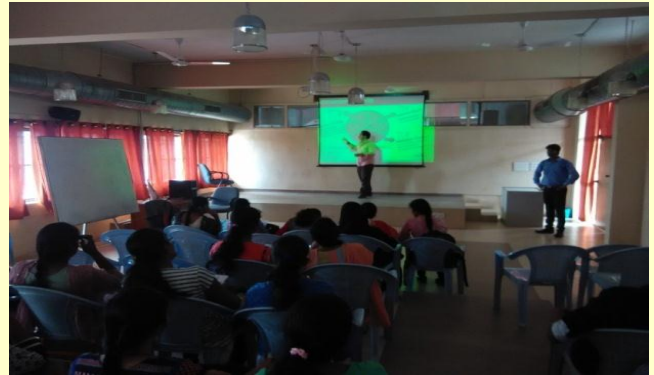
Fig Seminar on Higher Education