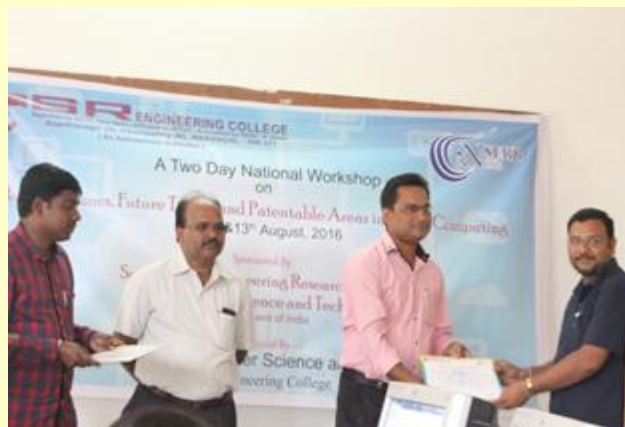
Fig. Certificate presentation of Faculty Development Program on Research issue future trends and patentable area in cloud computing