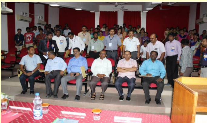
Fig. Inauguration of Faculty Development Program on Research issue future trends and patentable area in cloud computing